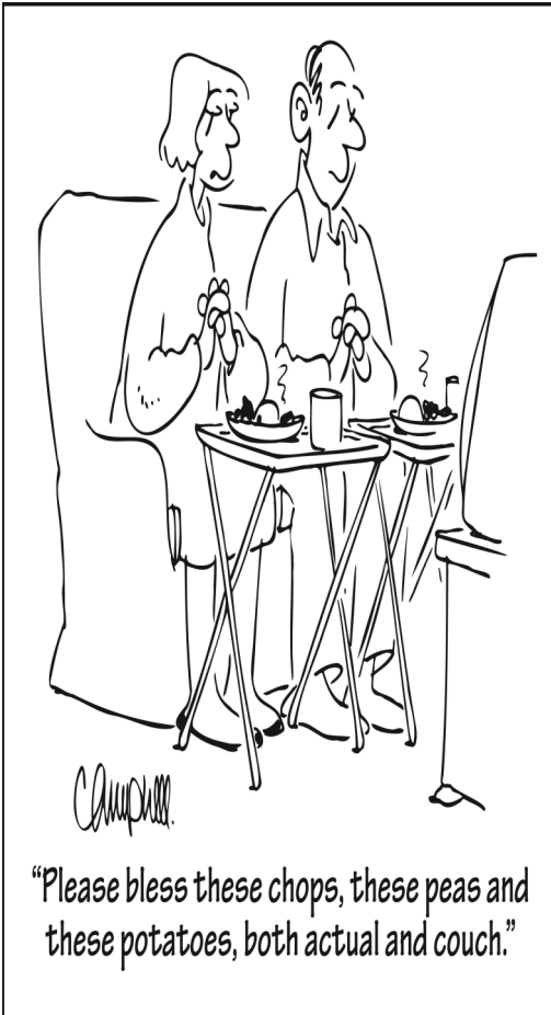
"Please bless these chops, these peas and these potatoes, both actual and couch."

non profit U.S. Postage Paid Permit No. 22 Sleepy Eye, MN 56085